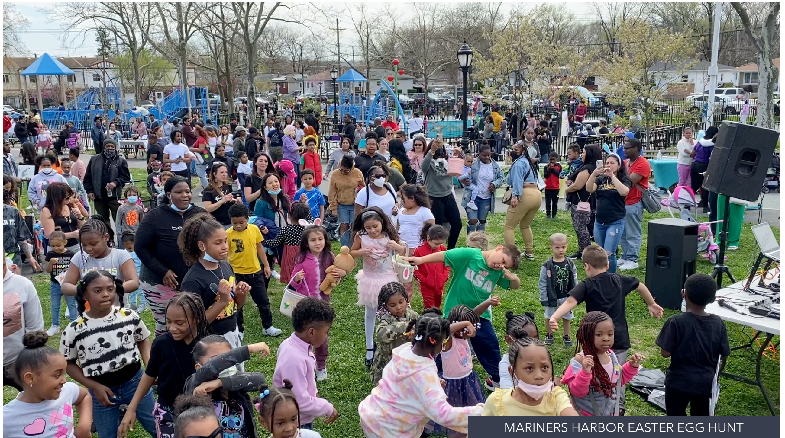
MARINERS HARBOR EASTER EGG HUNT