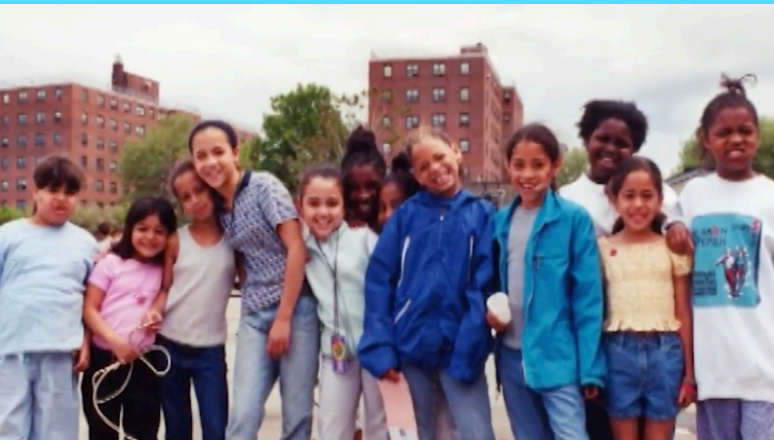
West Brighton Houses 1999