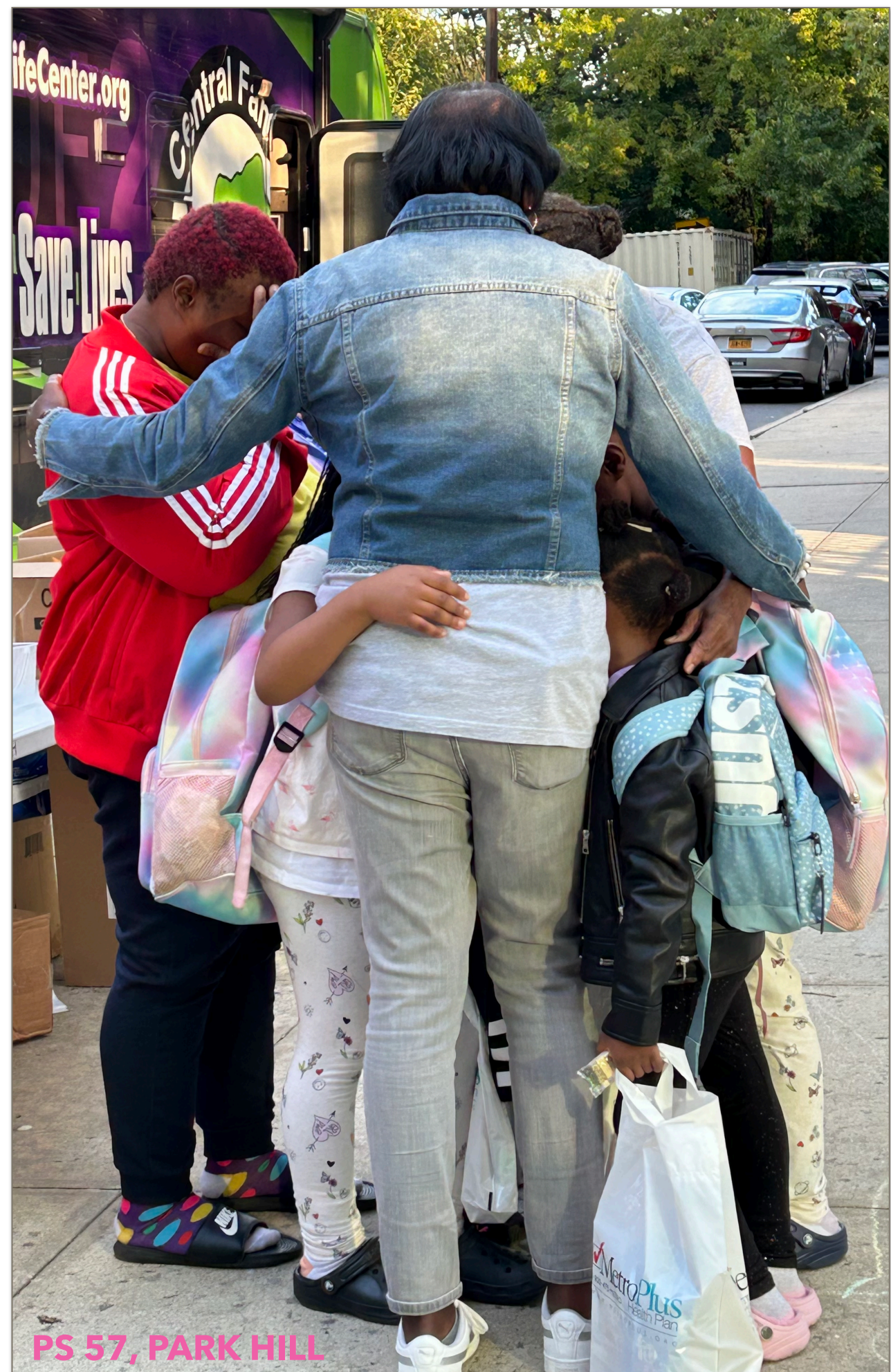
PS 57, PARK HILL

Only the body of Christ is capable of reversing the devastation of generations. We see healing and renewal wherever we "put the soles of our feet."